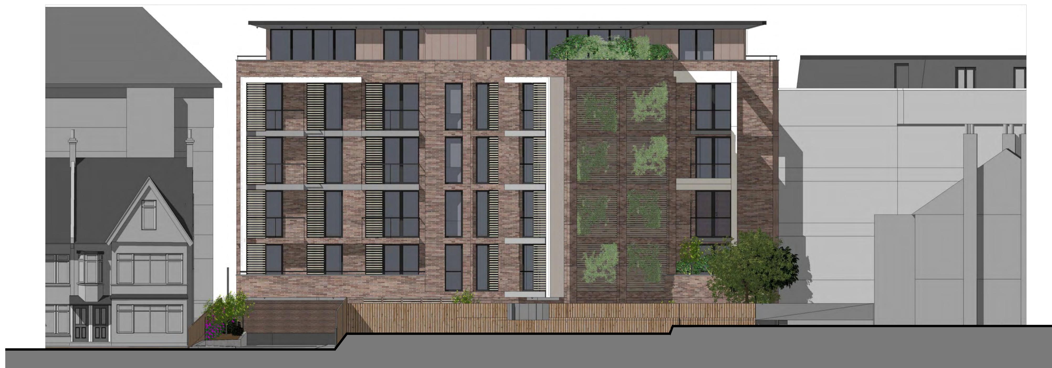
2 Proposed Rear (South) Elevation