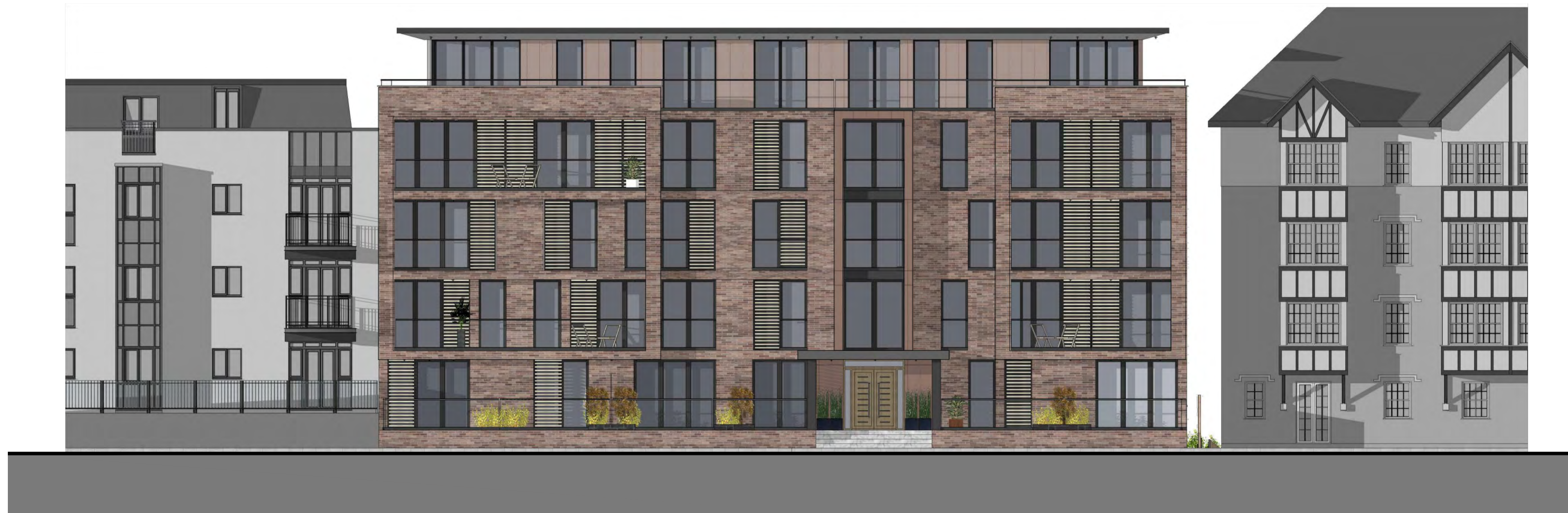
1 Proposed Front (North) Elevation

Do not scale this drawing. Work to figured dimensions only. This drawing is copyright of APS Designs and should only be reproduced with their express permission. Check all dimensions on site. Any discrepancies should be reported to APS Designs prior to commencement.